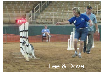
Lee & Dove